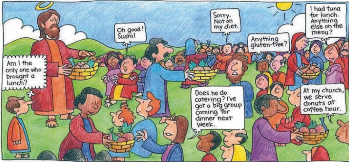
CROWD REACTION TO THE MIRACLE OF THE LOAVES AND FISHES: THE UNCUT VERSION.